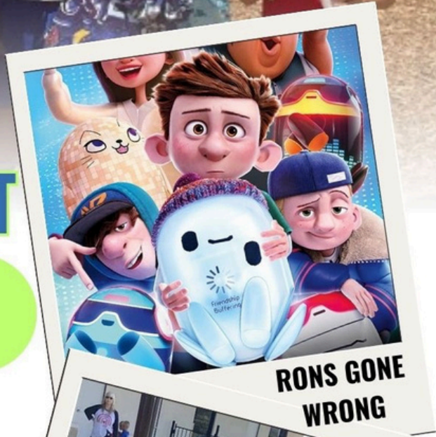
RONS GONE WRONG